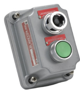
Pilot Light / Pushbutton