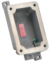
FXB-2 Dead End