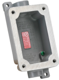
FXB-5 Feed Through