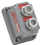
Double Pilot Light