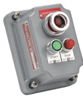
Pilot Light / Two Mini Pushbutton