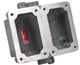
FXB-11 Double Gang Feed Through