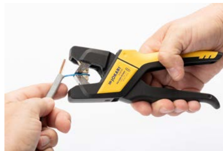
Automatic conductor stripping