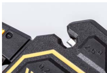
Cutting blade integrated into tool