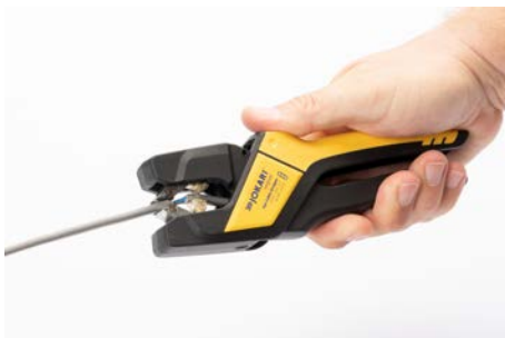
Automatic jacket stripping