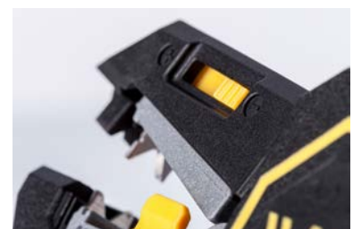
Adjust blade height on JT20100 for easy stripping of insulation