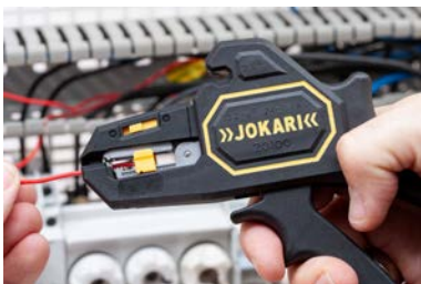
Adjust strip length