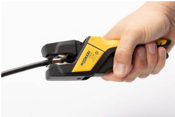
Pulls the jacket off the conductor upon closure