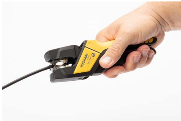
Strips jacket without damaging conductor insulation