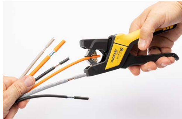
Wide range of sensor cable types