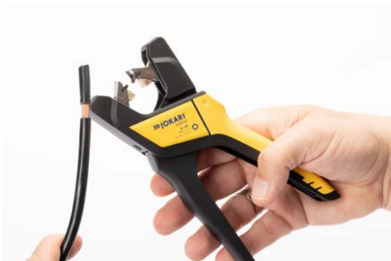
Automatic wire stripping