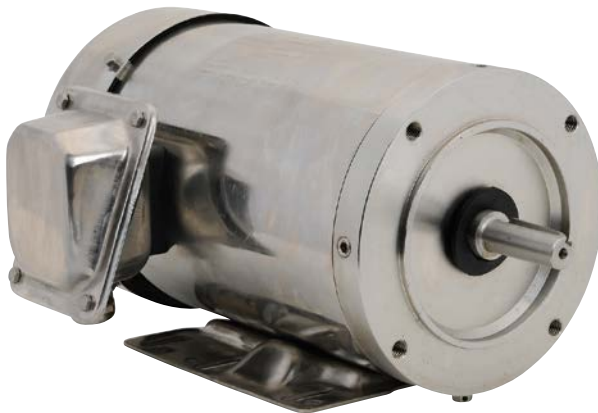
MTSS-xxx-3BDxx 3-Phase Stainless Steel 56C Frame with Feet