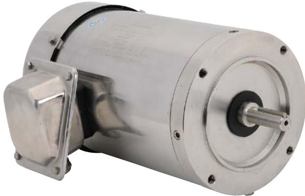
MTSS-xxx-3BDxxR 3-Phase Stainless Steel 56C Frame without Feet