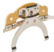
Stationary Switch MTAF2-SSW-05