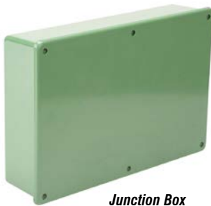
Junction Box MTAF2-JBOX-180