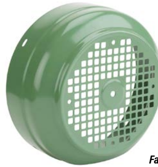
Fan Shroud MTAF2-SHROUD-180