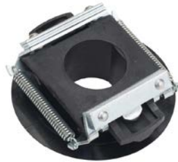
Centrifugal Switch MTAF2-CSW-05

IronHorse Farm Duty motors have a built-in manual overload switch to disable the motor if the load stops the motor (locked rotor). The overload is located in the motor's junction box, and has a manual reset switch. This switch is for locked rotor only. A separate motor thermal overload must be provided.