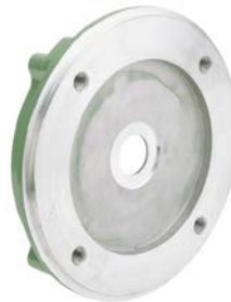
C-face Flange MTAF2-CFACE-180TC