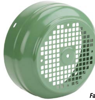
Fan Shroud MTAF2-SHROUD-180