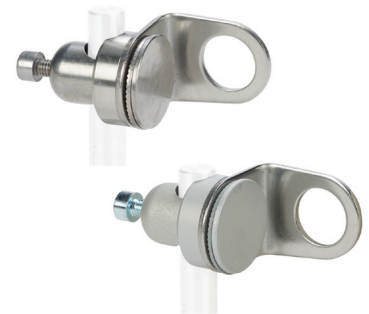
OPT2116 , OPT2117

Note: 304 Stainless steel mounting rods sold separately: OPT2109 (200mm [7.87 in] length), OPT2110 (300mm [11.81 in] length), and OPT2111 (500mm [19.69 in] length).