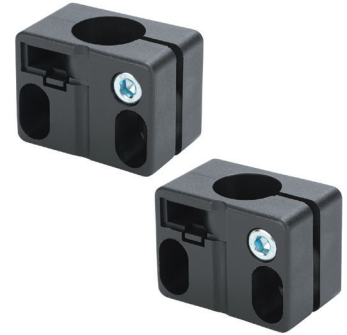
OPT2104 , OPT2105