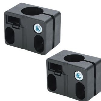
OPT2104 , OPT2105