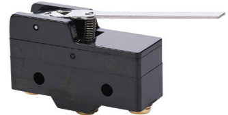
Lever Hinge Long (176109)