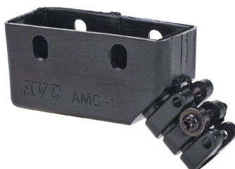
Terminal Enclosure for IDEM Micro Limit Switches (176000)