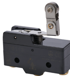
One-way Horizontal Hinge Lever With Steel Roller (176113)