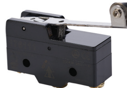
Lever Hinge Long With Steel Roller (176111)