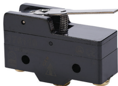
Lever Hinge (176110)