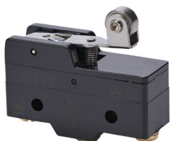
Lever Hinge With Steel Roller (176112)