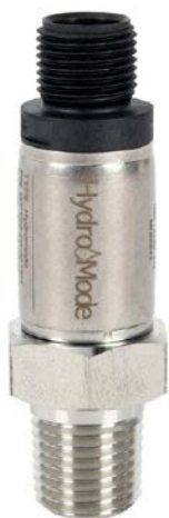
Part No. WPT25-20-0015H

The HydroMode WPT25 pressure transmitter series is UL Classified for NSF/ANSI/CAN 61 and 372, making it ideal for drinking water pressure measurement applications. Additionally, other media pressure sensing applications are possible due to the robust all stainless steel welded sensing element and wetted materials. The WPT25 series features full scale pressure ranges from 15 to 300 psig with a <1% Total Error Band over 0 to 50°C for optimum performance.