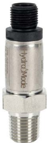
Part No. WPT25-20-0015H

The HydroMode WPT25 pressure transmitter series is UL Classified for NSF/ANSI/CAN 61 and 372, making it ideal for drinking water pressure measurement applications. Additionally, other media pressure sensing applications are possible due to the robust all stainless steel welded sensing element and wetted materials. The WPT25 series features full scale pressure ranges from 15 to 300 psig with a <1% Total Error Band over 0 to 50°C for optimum performance.