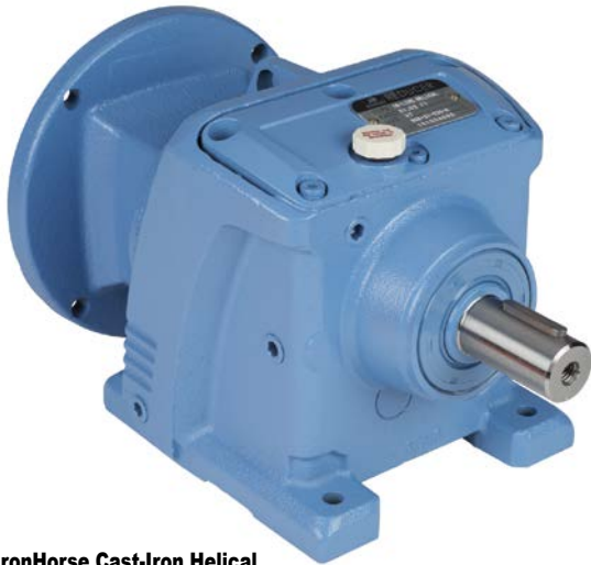
IronHorse Cast-Iron Helical Gearbox