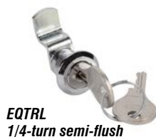
EQTRL 1/4-turn semi-flush