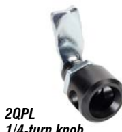
2QPL 1/4-turn knob