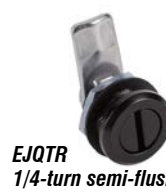
EJQTR 1/4-turn semi-flush