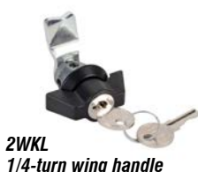
2WKL 1/4-turn wing handle