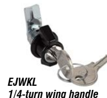
EJWKL 1/4-turn wing handle