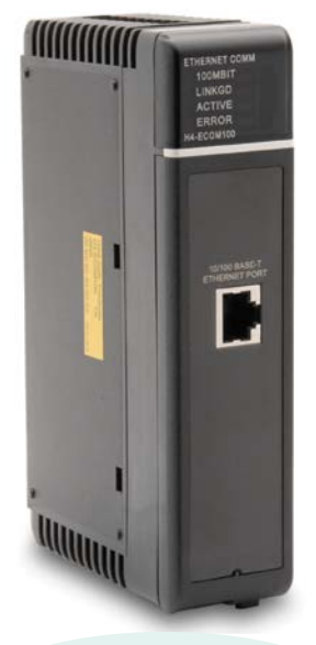
The H4-ECOM100 supports the Industry Standard Modbus TCP/IP Client/Server Protocol