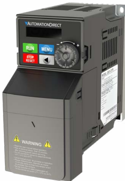
Drive with GS30A-CM-EIPKIP2 installed