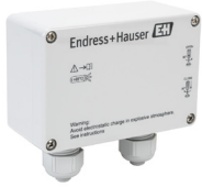
Part No. 52006152