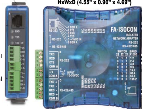
Removable terminal blocks make it easy to connect communication wiring. (Replacement terminal plug kit FA-ISOCOCON-P)