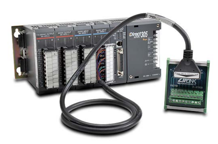
DL305 System with ZIPLink Module and ZIPLink Cable

Note: See the Compatibility Matrix tables under the ZIP Link Connector Modules catalog section.