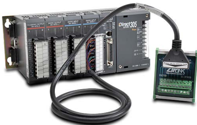
DL305 System with ZIPLink Module and ZIPLink Cable

Note: See the Compatibility Matrix tables under the ZIPLink Connector Modules catalog section.