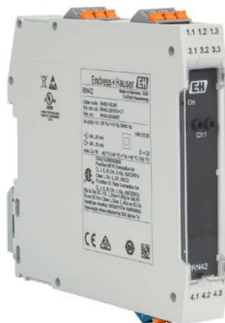
Part No. RN42-CB1B0-LT

The Endress+Hauser RN42 intrinsically safe isolation barriers provide galvanic isolation and intrinsically safe transmission of 0/4 to 20 mA analog signals from process instruments located in hazardous locations to the control system located in a non-hazardous location. The RN42 can accept current input from a 2-wire or 4-wire process instrument or transmitter and includes an internal power supply output for loop-powered transmitters. The output signal is 0/4-20mA and equal to the input signal. Models are available in a 1-channel configuration with either screw terminals or push-in terminals. Bidirectional transmission of digital HART communication signals is possible and includes connection sockets on the front for HART communicator devices. The RN42 is powered from a wide range power supply of 19.2 to 253 VAC/DC.