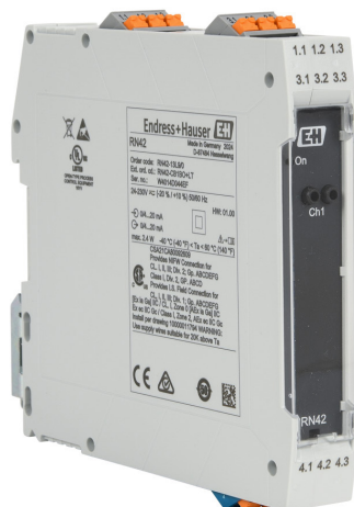
Part No. RN42-CB1B0-LT

The Endress+Hauser RN42 intrinsically safe isolation barriers provide galvanic isolation and intrinsically safe transmission of 0/4 to 20 mA analog signals from process instruments located in hazardous locations to the control system located in a non-hazardous location. The RN42 can accept current input from a 2-wire or 4-wire process instrument or transmitter and includes an internal power supply output for loop-powered transmitters. The output signal is 0/4-20mA and equal to the input signal. Models are available in a 1-channel configuration with either screw terminals or push-in terminals. Bidirectional transmission of digital HART communication signals is possible and includes connection sockets on the front for HART communicator devices. The RN42 is powered from a wide range power supply of 19.2 to 253 VAC/DC.