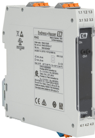
Part No. RN42-CB1B0-LT

The Endress+Hauser RN42 intrinsically safe isolation barriers provide galvanic isolation and intrinsically safe transmission of 0/4 to 20 mA analog signals from process instruments located in hazardous locations to the control system located in a non-hazardous location. The RN42 can accept current input from a 2-wire or 4-wire process instrument or transmitter and includes an internal power supply output for loop-powered transmitters. The output signal is 0/4-20mA and equal to the input signal. Models are available in a 1-channel configuration with either screw terminals or push-in terminals. Bidirectional transmission of digital HART communication signals is possible and includes connection sockets on the front for HART communicator devices. The RN42 is powered from a wide range power supply of 19.2 to 253 VAC/DC.