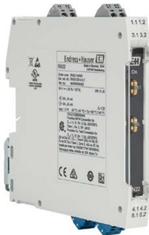
Part No. RN22-CB1A-LT

The Endress+Hauser RN22 intrinsically safe isolation barriers provide galvanic isolation and intrinsically safe transmission of 0/4 to 20 mA analog signals from process instruments located in hazardous locations to the control system located in a non-hazardous location. The RN22 can accept current input from 2-wire or 4-wire process instruments or transmitters and includes an internal power supply output for loop-powered transmitters. The output signal is 0/4-20mA and equal to the input signal. Models are available in 1-channel, 2-channel, or signal doubler configurations with either screw terminals or push-in terminals. Bidirectional transmission of digital HART communication signals is possible and includes connection lugs on the front for HART communicator devices. The RN22 is powered from a nominal 24VDC power supply.