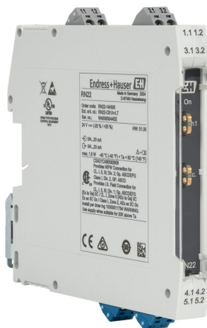
Part No. RN22-CB1A-LT

The Endress+Hauser RN22 intrinsically safe isolation barriers provide galvanic isolation and intrinsically safe transmission of 0/4 to 20 mA analog signals from process instruments located in hazardous locations to the control system located in a non-hazardous location. The RN22 can accept current input from 2-wire or 4-wire process instruments or transmitters and includes an internal power supply output for loop-powered transmitters. The output signal is 0/4-20mA and equal to the input signal. Models are available in 1-channel, 2-channel, or signal doubler configurations with either screw terminals or push-in terminals. Bidirectional transmission of digital HART communication signals is possible and includes connection lugs on the front for HART communicator devices. The RN22 is powered from a nominal 24VDC power supply.