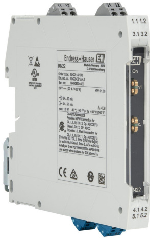
Part No. RN22-CB1A-LT

The Endress+Hauser RN22 intrinsically safe isolation barriers provide galvanic isolation and intrinsically safe transmission of 0/4 to 20 mA analog signals from process instruments located in hazardous locations to the control system located in a non-hazardous location. The RN22 can accept current input from 2-wire or 4-wire process instruments or transmitters and includes an internal power supply output for loop-powered transmitters. The output signal is 0/4-20mA and equal to the input signal. Models are available in 1-channel, 2-channel, or signal doubler configurations with either screw terminals or push-in terminals. Bidirectional transmission of digital HART communication signals is possible and includes connection lugs on the front for HART communicator devices. The RN22 is powered from a nominal 24VDC power supply.