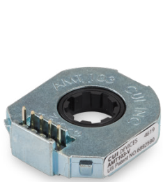
Kit Encoder AMT