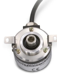
Medium Duty TRD-NH