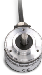
Medium Duty TRD-N