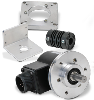
Medium Duty TRDA-25 (w/MS connector)