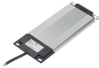
50W Flat Heater 061000-00