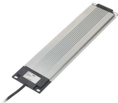
100W Flat Heater 061010-00