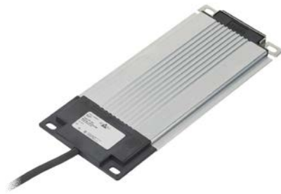
50W Flat Heater 061000-00