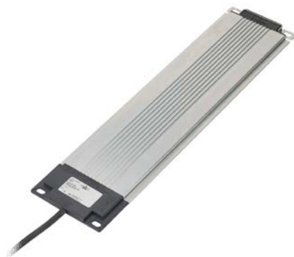
100W Flat Heater 061010-00