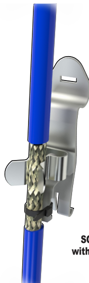
SCFZ-EMV / MSCFZ-EMV installation shown with cable tie securing cable to strain relief tab