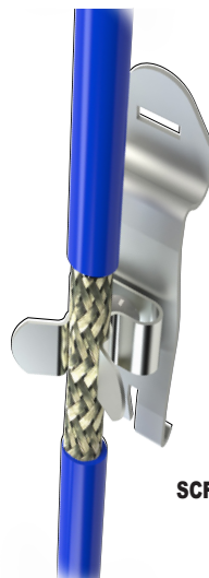
SCF-EMV / MSCF-EMV installation shown with shielded cable