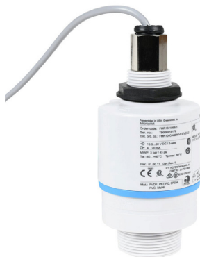
Part No. FMR10-CAQBMVCEE2

The Endress+Hauser Micropilot FMR10 pulsed radar liquid level sensor provides reliable, continuous, non-contact level measurement for liquids in storage tanks, open basins, pump lift stations, cooling towers, and canal systems. The Micropilot FMR10 can be configured to provide a 4-20mA analog output for liquid levels up to 8 meters (26.25 ft) or 12 meters (39.37 ft) when the flooding protection tube accessory is installed. Configuration and operation of the Micropilot FMR10 is accomplished using its Bluetooth wireless technology interface and the Endress+Hauser SmartBlue mobile app which, includes a linearization function that allows the conversion of the measured value into any unit of length, weight, flow, or volume. Envelope curves of the process can also be displayed and recorded using SmartBlue. The Micropilot FMR10 PVDF sensor body