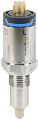
Part No. FTW23-CA4MWVJ