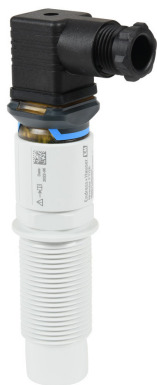
Part No. FTI26-CA4VWDG