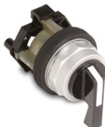
HT8JEH1D lever version