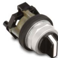
HT8JBH1D knob version