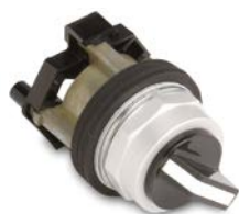
HT8JAH3A knob version