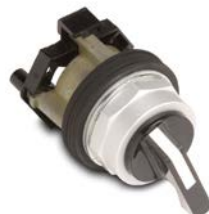
HT8JDH3A lever version