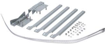
PMKLRG - for Large Enclosures