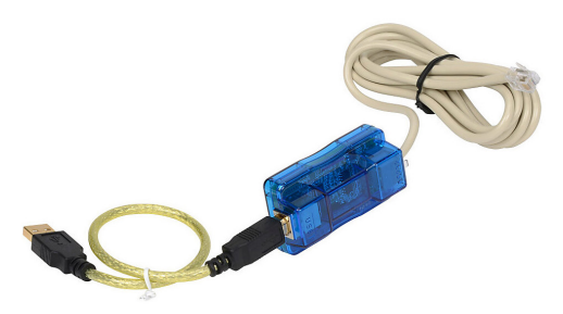
Part No. <u>EA-MG-PGM-CBL</u> $60.00