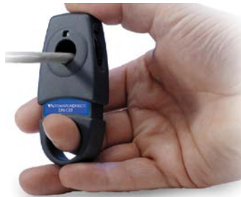
DN-CST Precision Stripping Tool [Squeeze, insert cable, rotate, & remove]