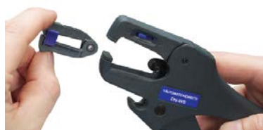
DN-WS stripping blade replacement