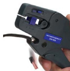
DN-WS wire cutting