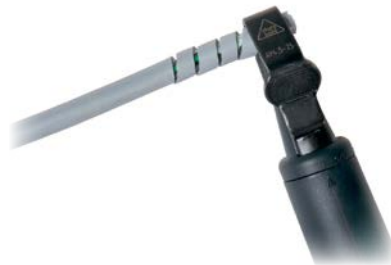
Spiral cable stripping option