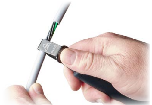
Circular cable stripping option