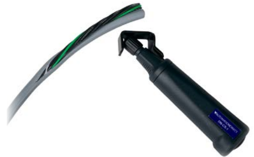
Lengthways cable stripping option