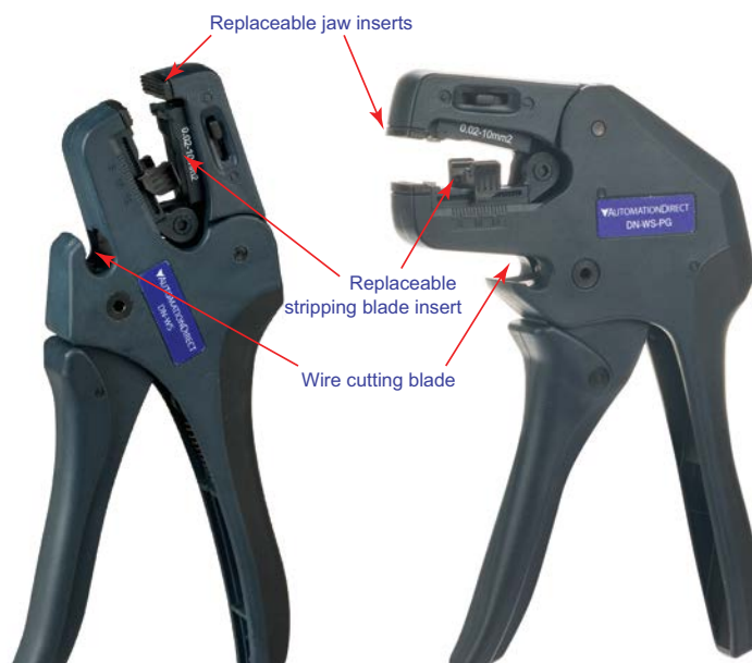
DN-WS Cutting & Stripping Tool