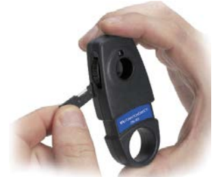
Precision Stripping Tool Easily replaceable blade