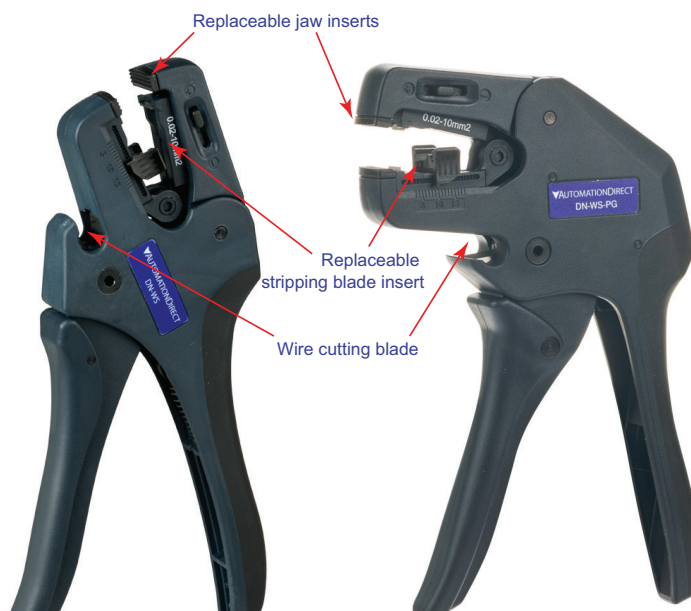
DN-WS Cutting & Stripping Tool