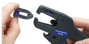
DN-WS stripping blade replacement