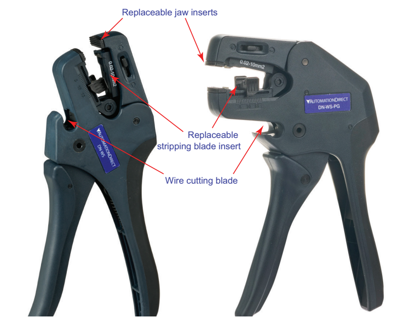
DN-WS Cutting & Stripping Tool