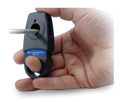
<u>DN-CST</u> Precision Stripping Tool [Squeeze, insert cable, rotate, & remove]