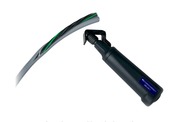
Lengthways cable stripping option