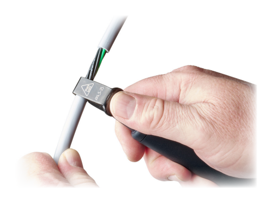
Circular cable stripping option