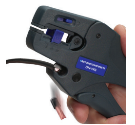
DN-WS wire cutting