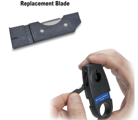
Precision Stripping Tool Easily replaceable blade