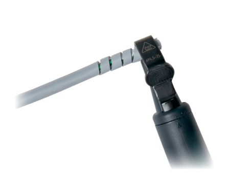
Spiral cable stripping option