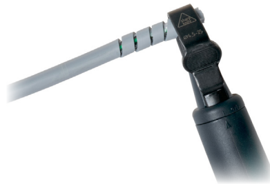
Spiral cable stripping option