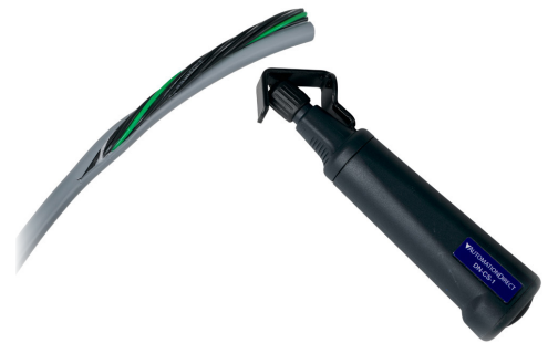
Lengthways cable stripping option