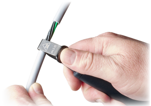
Circular cable stripping option