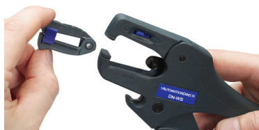
DN-WS stripping blade replacement