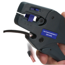
DN-WS wire cutting