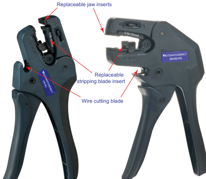
DN-WS Cutting & Stripping Tool