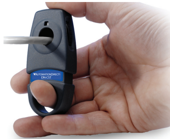
DN-CST Precision Stripping Tool [Squeeze, insert cable, rotate, & remove]