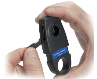
Precision Stripping Tool Easily replaceable blade