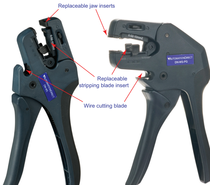
DN-WS Cutting & Stripping Tool