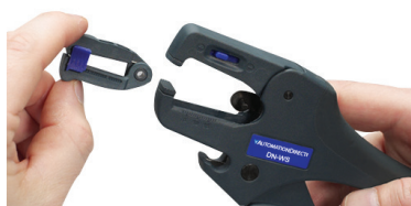
DN-WS stripping blade replacement