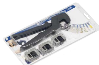
DN-CT-SET Crimping Tool & Die Set