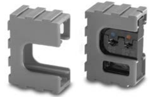
DN-CT-Dx die & holder

Dies come in modular holders that can be connected together when not in use.