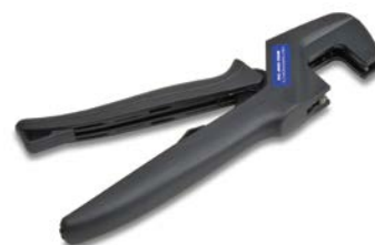
DN-CT-HDL Crimping Tool

* The DN-CT-xx series features a crimping tool with multiple interchangeable dies separately available. The die pairs are held together for easy handling, and can be interchanged without separate tools.