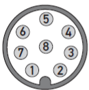
8-pin M12 Connector