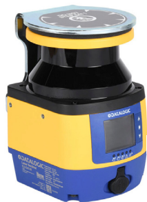
SLS-BRACKET-C assembled with SLS-SA5-08