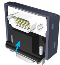
DL06 15-pin high density D-sub port adapter D0-06ADPTR

See the Wiring Solutions section in this catalog for more information.