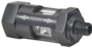
Part No. MF-0404-N

CITO flow indicators use a molded turbine to indicate when fluid is flowing. They are a useful addition to many piping systems.