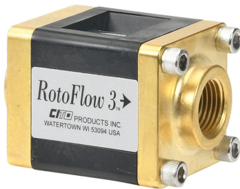
Part No. RFH-0808