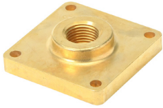
Part No. EC-3401-K

CITO StackFlow body inlet port adapters are available in 1/2" NPT up to 1-1/2" NPT. Inlet ports can mount to the left or right-hand inlet of the modular body. The brass inlet port adapters include mounting hardware.