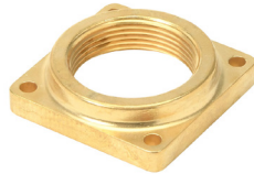
Part No. EC-3121-K