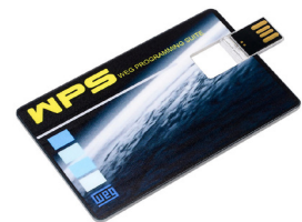
CFW-WPS USB Installation Card