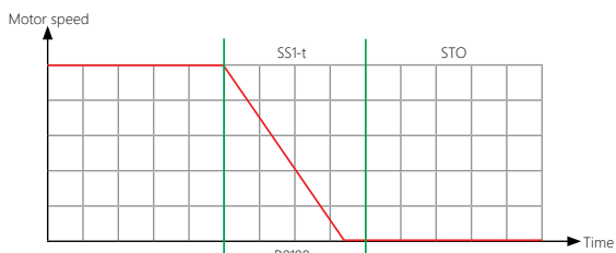
Figure 1.2: SS1-t behavior