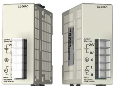
CLICK 24VDC Power Supply C0-00AC or C0-01AC

Refer to the Power Budgeting example shown on the following page. The table shows required current for a CLICK PLUS PLC, two I/O modules, and a C-more Micro. Use the total amperage values to select a suitable power supply.