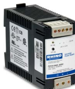
Other 24VDC Power Supply Example: PSP24-060S